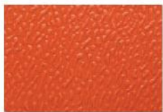
Brick Red (SRT-C-001)