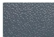
Dark Grey (SRT-C-009)