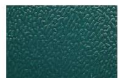
Dark Green (SRT-C-010)

Note: Special colours will need a lead time of 40 days.