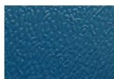
Blue Grey (SRT-C-008)