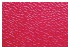
Purplish Red (SRT-C-002)