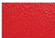
Hot Red (SRT-C-007)