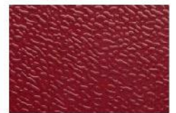
Rose Red (SRT-C-005)